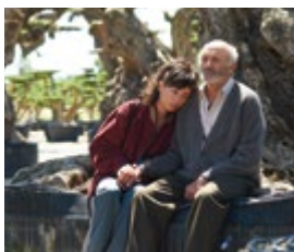
Dir. Iciar Bollain Spain 2016 / 100mins

"universally appealing, grafting gentle comedy with bristling social consciousness tragedy" - Variety Won major awards at Santa Fe, Seattle and Los Angeles Film Festivals.