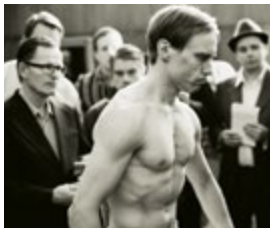
Dir Juho Kuosmanen Finland/Germany 2016 92 mins